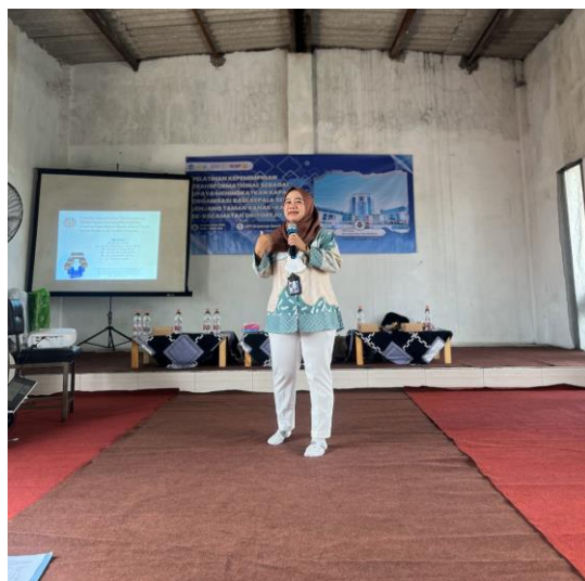
Figure 2. Presentation from an Expert

The interpretation of the mean score for each item was based on the categories presented in Table 1 below: