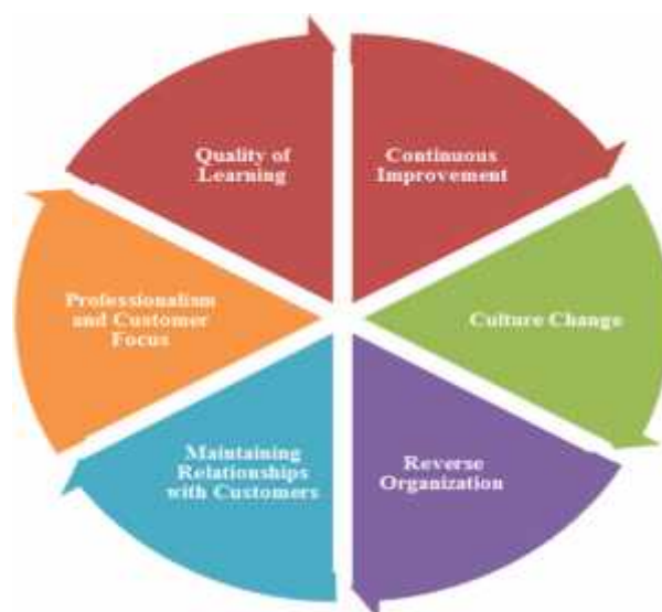
Figure 2. Strategy of Improving Madrasah

In this case, it takes place in Madrasah Aliyah in the Subdistrict city (as a sample of MAN 1 Kalibawang), Madrasah Aliyah in the regency city (as a sample of MAN Wates 1), and Madrasah Aliyah in the Municipality (as a sample of MAN Yogyakarta II). Ideas about the importance of implementing Total Quality Management (TQM) for schools concern several sides as explained in the theoretical concepts mentioned above. The theoretical concept approach is elaborated, about how the futurology of total quality management perspective education in a practical, strategic approach in running the Madrasah Aliyah organization. The concept includes continuous improvement, culture change, reverse organization, maintaining relationships with customers, colleagues as customers and the quality of learning.