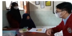
Figure 5. Small group and individual teaching skills