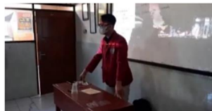
Figure 4. Variation skills