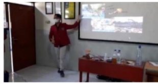
Figure 2. Class management skills

conversation. The teacher's activities can be seen from the Figure 1, Figure 2, Figure 3, and Figure 4.